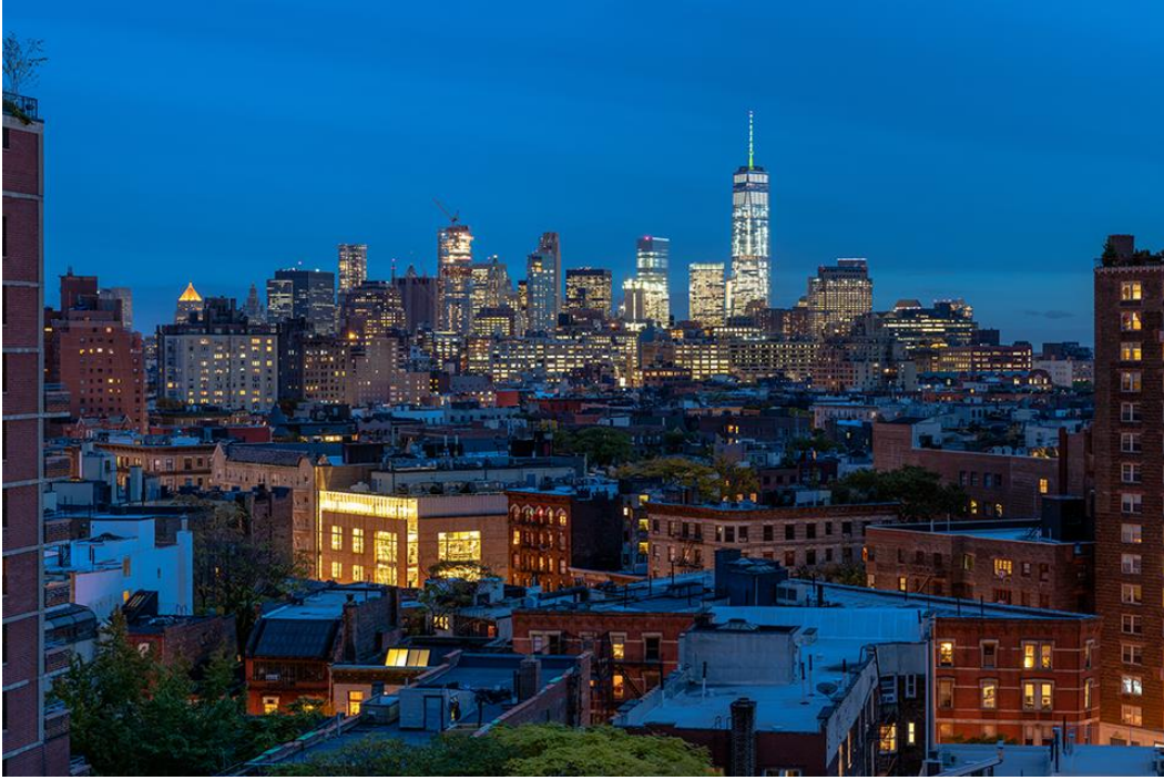
The great room has views of One World Trade Center in Lower Manhattan. Evan Joseph