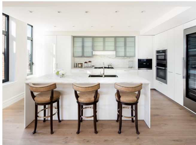
The kitchen features marble countertops and a custom-paneled refrigerator.