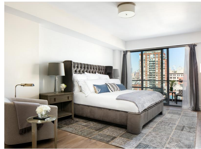
The master suite opens to a private balcony with uptown views.