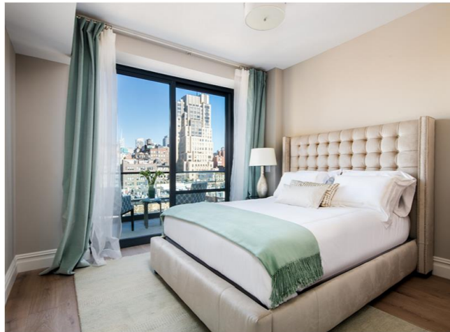
The residence has four bedrooms. A second bedroom with a balcony is shown. EVAN JOSEPH