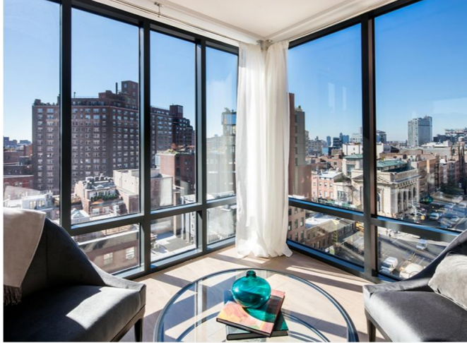
A sitting area in the sun room is shown.