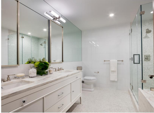
A soaking tub in the master bathroom is clad in marble. The bathroom has polished nickel fixtures and radiant-heat floors. EVAN JOSEPH