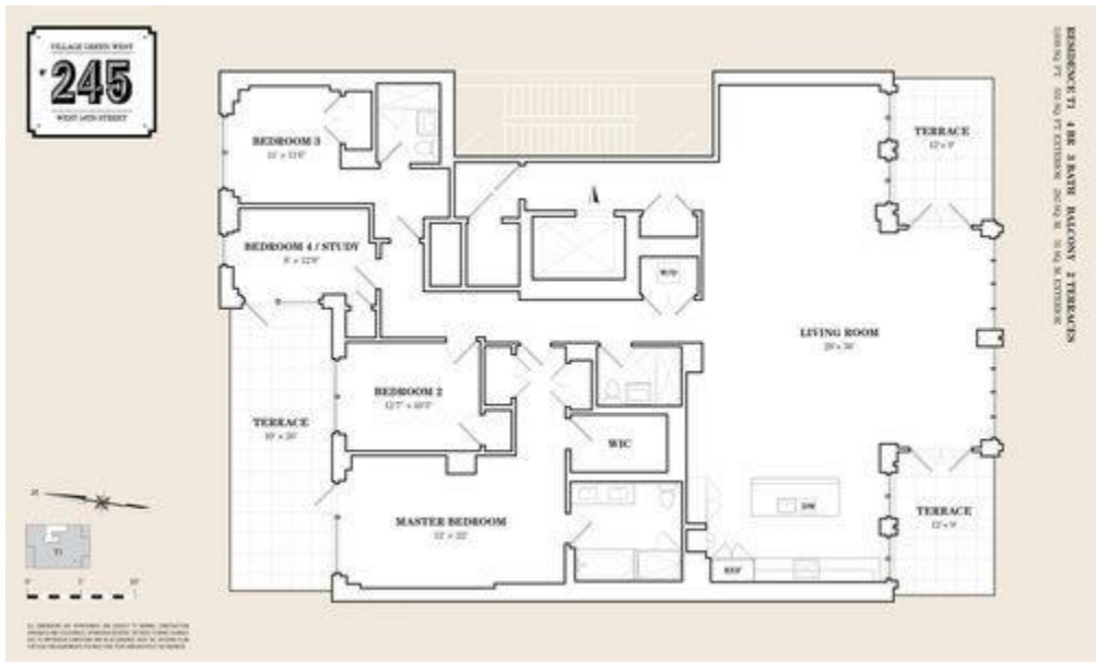
Sample penthouse floorplan