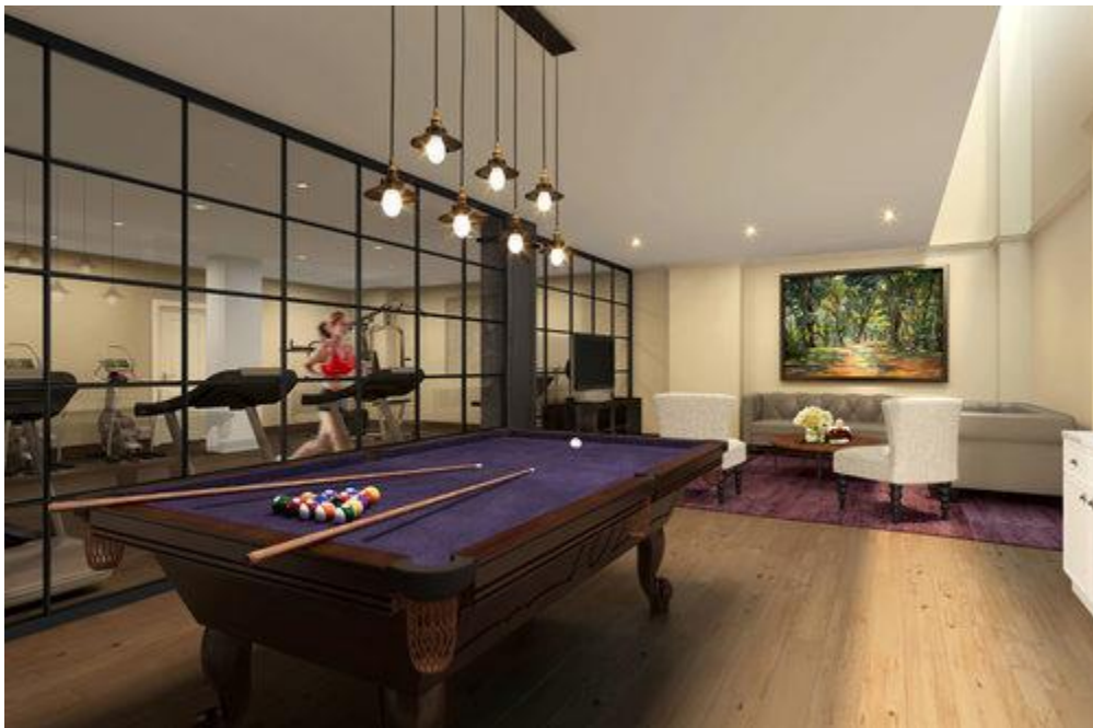
Wellness center and lounge rendering