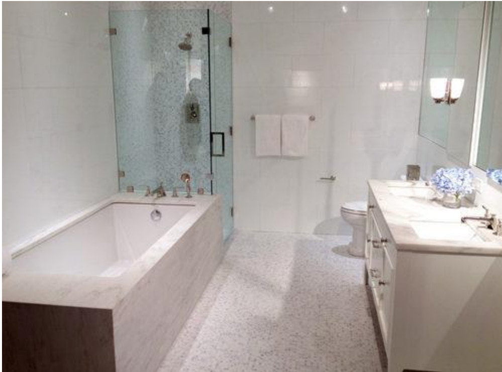
Model bathroom - to size! - in the sales gallery