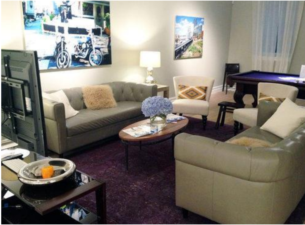
Model living room in the sales gallery