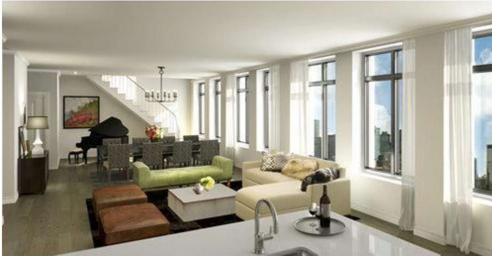
Penthouse living room rendering