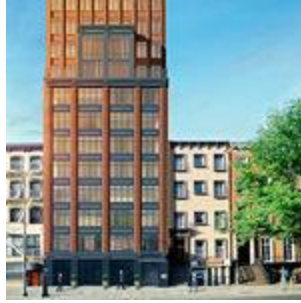
Village Green West

Like 199 Mott, Village Green West is a new entry into Alfa Development's Green collection of buildings. The condo was designed by KBA Architects to be reminiscent of the "19th century industrial era," and its 27 units are one-bedrooms through four-bedrooms, plus another four full-floor penthouses. Amenities include a coffee bar and wellness center, prices range from $1.3 million to a starting ask of $7.6 million for the least expensive penthouse, and the whole thing should hit the market in late September.